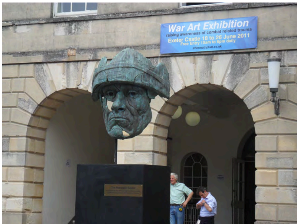
Picture 3: The Abandoned Solider being installed at Exeter Castle, 2011