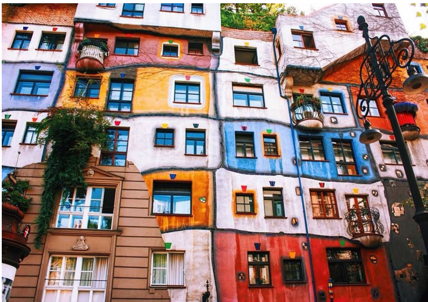
Hunderwasser House, Vienna.